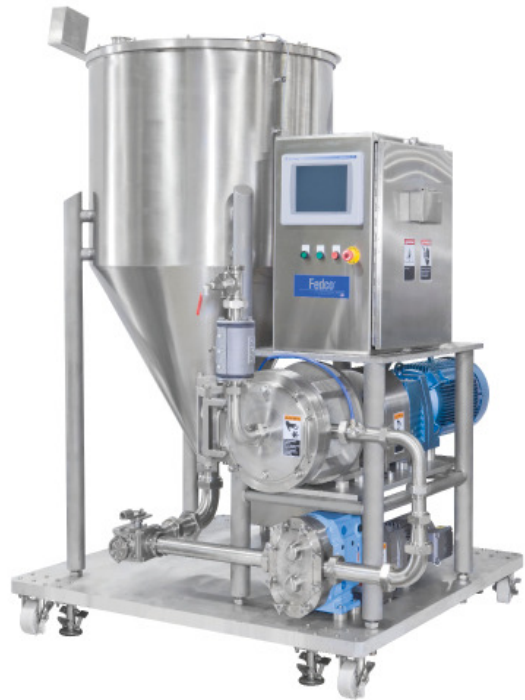
Open Frame Style Continuous Mixer