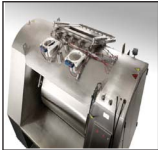
Canopy additions such as Ingredient door, liquid and/or dry ingredient inlets, canopy scraper